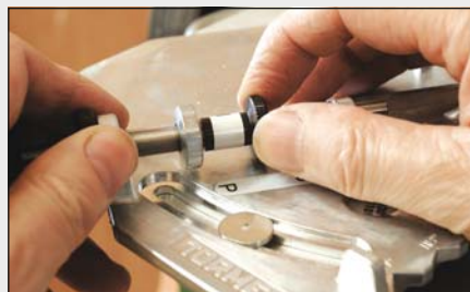
To cut the secondary facet, tilt the base away from the stone and move the drill holder forward up to the second mark on the guide. Then tilt the base forward until the point of the drill touches the stone. Adjust the stop nut to give the required secondary facet