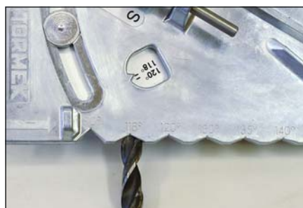
Check the bit's point angle by holding it against a groove on the edge of the guide