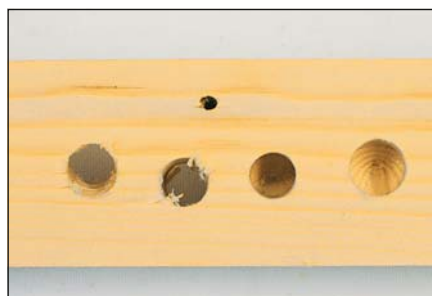
A 'new' bit cut the holes on the left, and a sharpened one those on the right