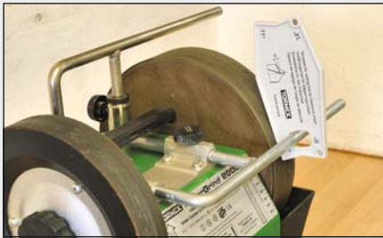
Set the universal support 14mm from the wheel using the hole in the setting template

This attachment would be a long-term investment for most people, as you would need to sharpen a lot of bits before it paid for itself. However, it grinds such a sharp edge that the drill bit's performance is transformed, and the resulting holes produced are much cleaner and easier to drill. What's more, the four-facet point created by this jig allows the drill to cut more accurately sized holes, as the drill has no tendency to start oversize or oval holes. Last of all, you're no longer tempted to use blunt bits, as it's so easy to re-hone the edge once a bit has been properly sharpened on the jig.