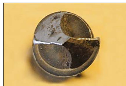
This close-up shows a standard twist drill bit in need of resharpening