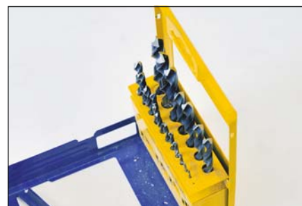
This full set of re-sharpened twist drill bits has been given a new lease of life