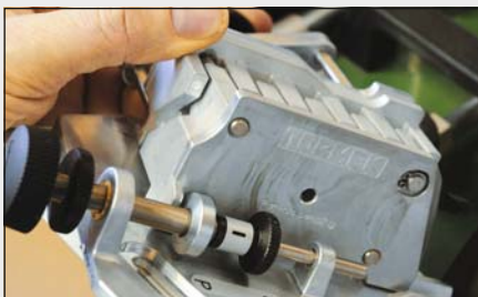
Place the drill holder on the guide and adjust the setting screw so the point of the bit just touches the stone. Then turn the setting screw inward to give the required cutting depth; one turn is 0.5mm. You can now cut the primary facet on both edges of the drill