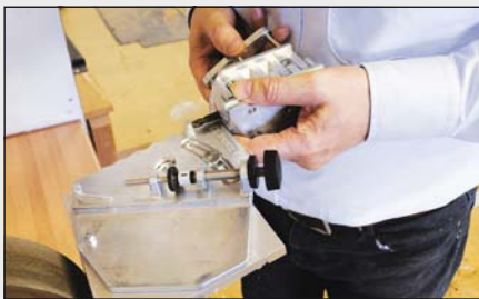
Mount the drill bit into the holder and set the length to the stop on the guide