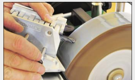
I found it best to give the nut 1½ turns, grind both sides and gradually adjust the stop nut to sneak up on the primary facet