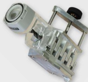
Turn the drill bit to align its cutting edge with the lines on the holder; use the magnifier if needed