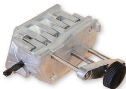
The drill holder has two clever pairs of interlocking fingers that grip the bit