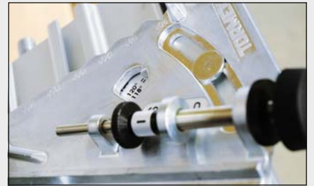
Set the point angle on the guide before sliding it onto the base plate