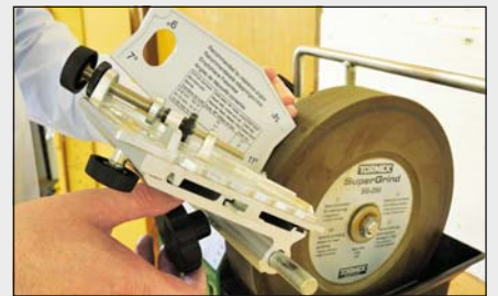
Tilt the base up and set it to the required clearance angle using the template