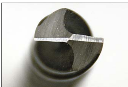
This image reveals the four-faceted point of a freshly-sharpened bit